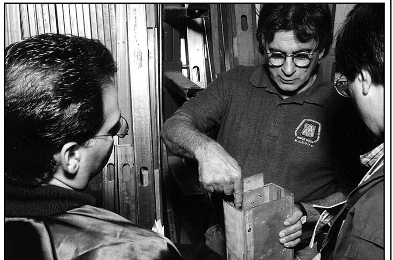
Architects investigate metal stud construction