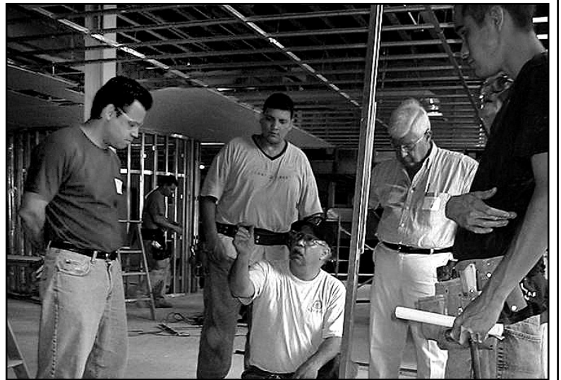
Architects learning how to construct a wall